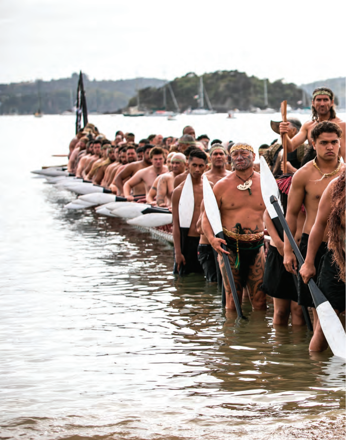
At 35.7 metres long, Ngātōkimatawahaorua carries a crew of 88, and has room for another 40 passengers seated down the centre. Launched for the 1940 centennial of the signing of Te Tiriti o Waitangi the Treaty of Waitangi, the cultural icon remains a drawcard for kaihoe and tourists alike.