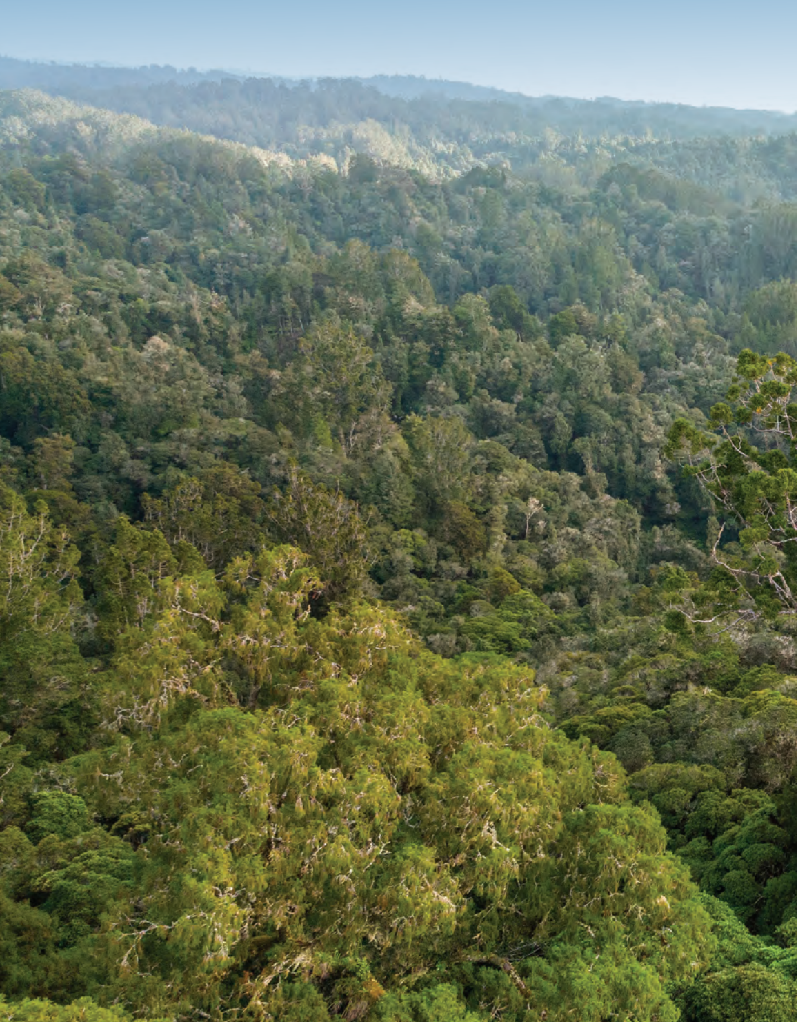
Puketi Forest and neighbouring Omahuta Forest comprise one of the largest tracts of native forest in Northland, at a combined 15,000 hectares (37,000 acres).