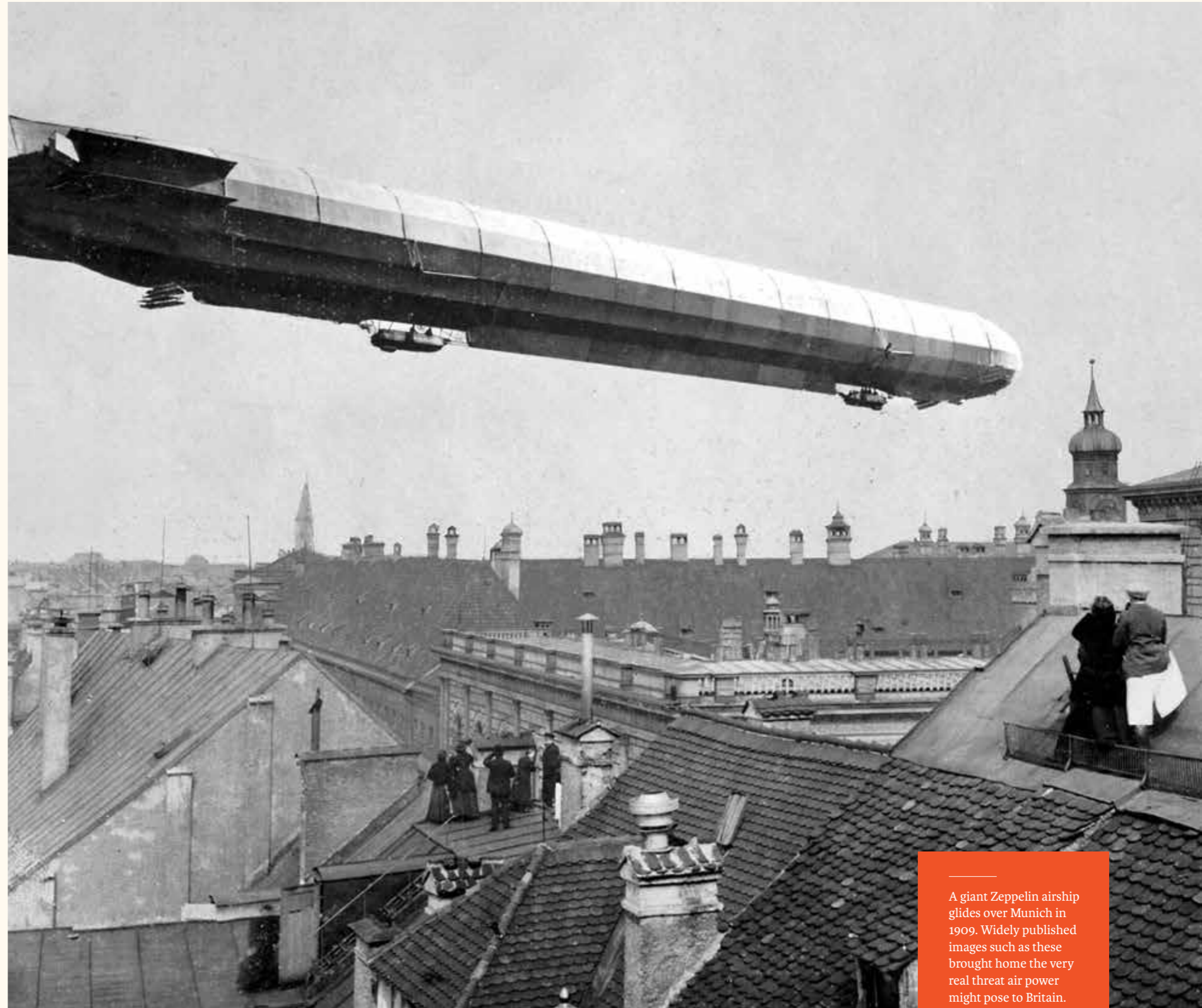
A giant Zeppelin airship glides over Munich in 1909. Widely published images such as these brought home the very real threat air power might pose to Britain.

The story, subsequently published in book form as The War in the Air , drew on German advances in airship construction and the rapid development of heavier-than-air machines as pioneered by the Wright brothers in the early 1900s. Why had the Americans and the British been caught so flat-footed by the German attacks