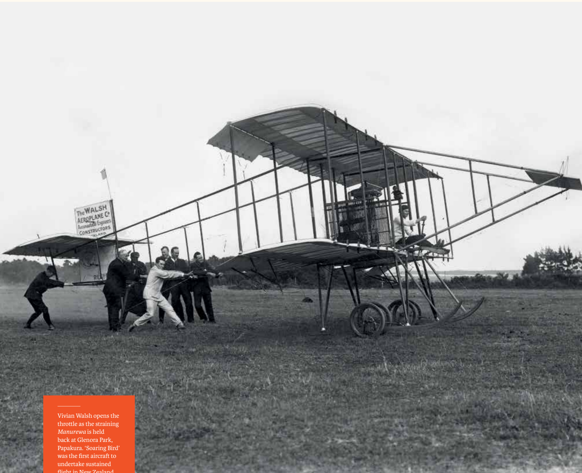
Vivian Walsh opens the throttle as the straining Manurewa is held back at Glenora Park, Papakura. 'Soaring Bird' was the first aircraft to undertake sustained flight in New Zealand.

and spectators lying on their stomachs were able to gauge the strength of the wheels and undercarriage as the aeroplane made short leaps past them.